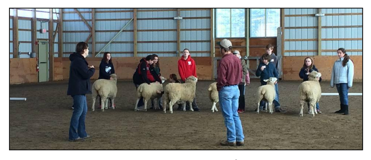
Go to our Facebook page or website for more pictures.