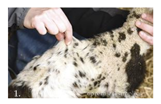
Pinch the skin along the back.

Dehydrated lambs can easily become dead lambs—which results in less lbs produced and less $$ in your pocket. It's easy to miss so be aware.