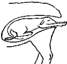
Figure 2. Normal Presentation