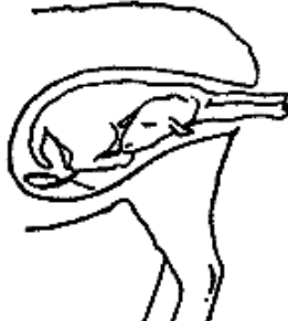
Figure 6. Head Back