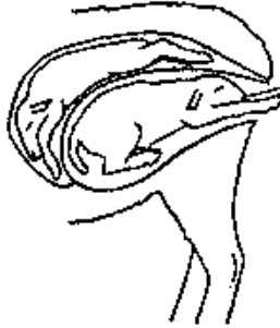
Figure 9. Twins - Front and Back