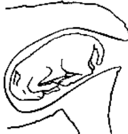
Figure 3. Breech Presentation