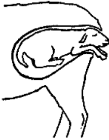
Figure 8. Elbow Lock