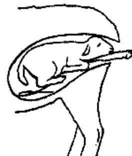
Figure 4. One Leg Back