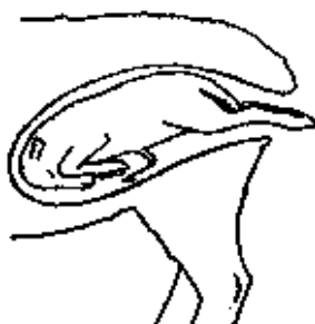
Figure 5. Hind Legs Only